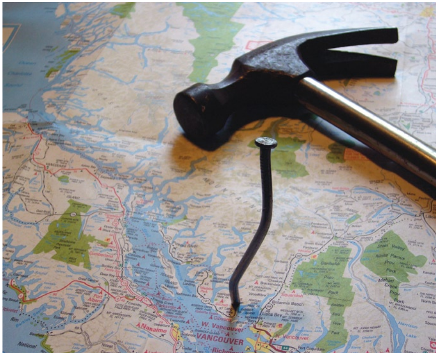
Figure 4 One cannot compromise on the relative positional integrity of RTN CORS

It is no surprise that Height Modernization initiatives, particularly those